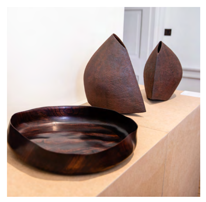
Collect 2020

Two-thirds of makers felt that an easily accessible, centralised, signposted searchable database would help with sales, with extended search functions including visual tags, to identify objects based on colour or pattern or style without needing to know a maker's name. Built-in algorithms replicating the 'Customers who viewed this item also viewed ...' approach of online retailers would expose potential buyers to a wider range of makers beyond those they are already familiar with and buying from.